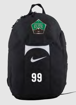
*BACKPACK is required for all new-to-club members.

Purchase of the new backpack is optional for returning players who own the 2022 NW ELITE FC logoed version of black Nike Academy backpack. No other replacements or substitutions are permitted.