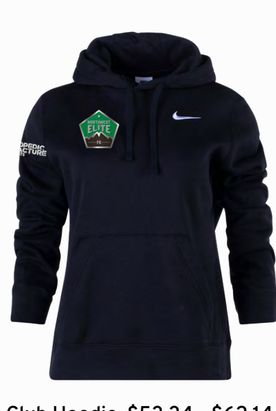
Club Hoodie $53.34 - $62.14